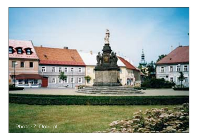
The Doksy square with the Marian sculpture

The town of Stare Splavy, situated on the northern shore of the lake, became part of Doksy in 1850 and has ever since contribute to the development of tourism in the region.